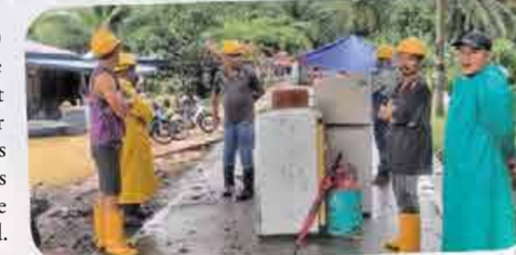
Kampung Spang Loi was flooded with the love and help from Tambang Estate.

Over at Tambang Estate in Segamat, Johor, our estate workers also came out in full force and worked in harmony to help the villagers. Our estate management constructed an excess road for the Kampung Spang Loi villagers to take refuge at the flood relief centre (PPS). Once they were safely situated at the PPS, we helped to supply clean water to the villagers. Altogether, there were 400 villagers who were affected by the floods. Prior to that, we worked fast to move and help to salvage whatever we could from their homes. Items such as essential electronic appliances and furniture were shifted to a safe location before the floods worsened. The debris and clutter from the downpours were efficiently removed after the floods.