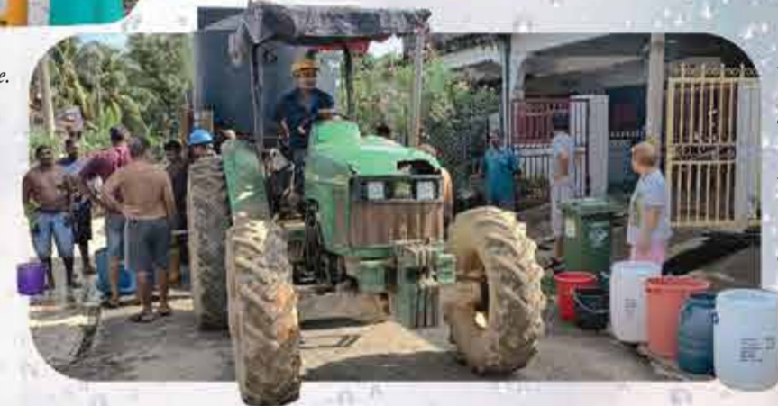
From cleaning the debris to distributing water, our Bukit Dinding volunteers reached out continuously.