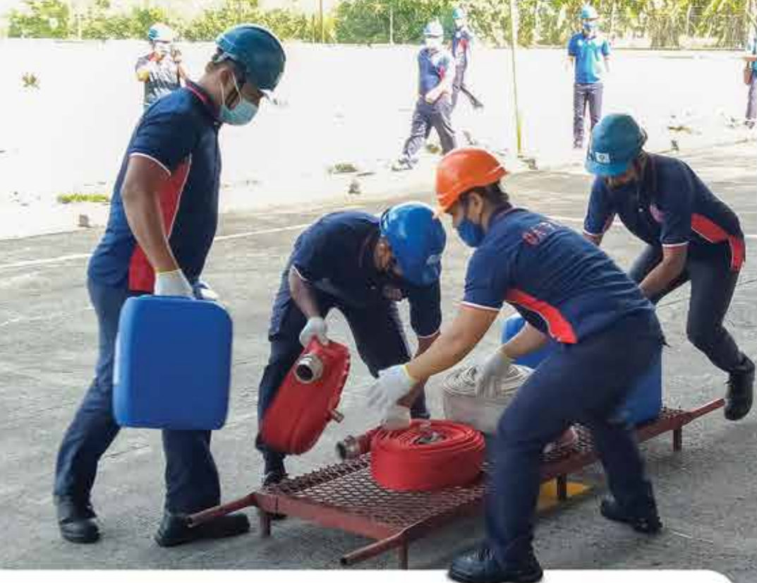
Each ERT member is trained to be prepared for and to respond to emergencies and disasters quickly and without hesitation.

Squatters from Kampung Sundang Laut, Batu Sapi, Sandakan were left dismayed when a fire razed through their homes in an early morning on 21 April 2021. But luckily, the blaze was brought under control after more than an hour at 9:17 am by the Sandakan Zone Fire & Rescue Department with the help of the Emergency Response Team (ERT) from IOI Edible Oils Sdn Bhd (IOIEO), IOI Bio-Energy Sdn Bhd (IOIBE) and the villagers.