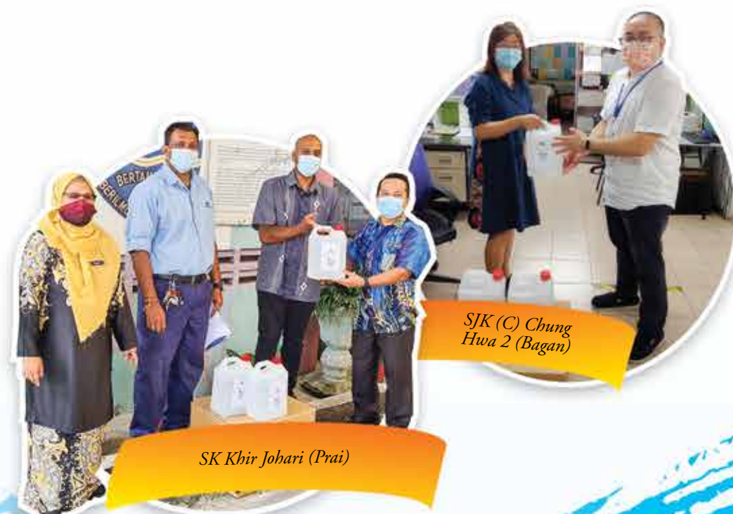
SK Khir Johari (Prai)

With the contribution of the hand sanitisers, the teachers hope to raise greater awareness on the importance of personal hygiene among students so that they avoid touching their face, eyes, nose and mouth.