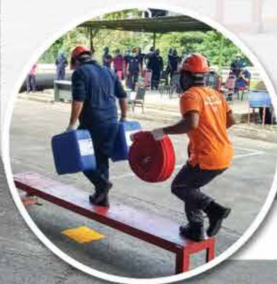
Trust and integrity are essential in an ERT that relies on teamwork and dedication of each member.

Thanks to the co-operation of everyone in issuing speedy and rapid emergency response, no injury or fatality occurred. Together, 100 houses in the village were saved from being destroyed. A total of 53 houses were affected and 350 victims have since been moved to a Temporary Evacuation Centre at the Batu Sapi's Housing Project multi-purpose hall.