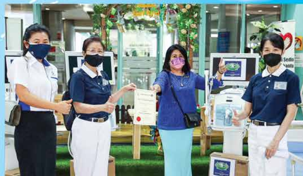
Together, we hope that the medical supplies will extend a helping hand to our frontliners as we join hands to win this uphill battle against Covid-19.

The donation supports Tzu-Chi Foundation Malaysia's Solidarity Fund , which was set up in response to the urgent needs of our public hospitals and healthcare professionals who are battling Covid-19 on the frontlines.