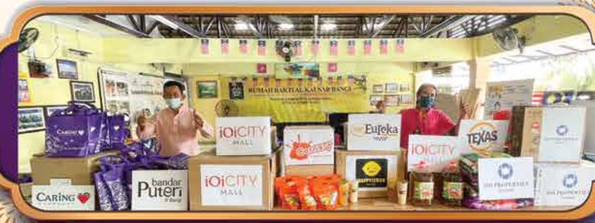
Rumah Bakti Al-Kausar was set up as a home for orphans and the poor.

crunchy Texas Chicken, while we presented our donation in the form of food and groceries, duit raya and electrical items.