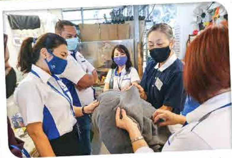
These thermal blankets were developed in Taiwan using collected plastic bottles that were sorted and processed. They will come in handy especially for disaster victims.