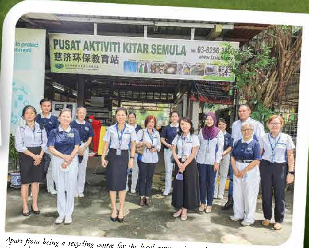
Apart from being a recycling centre for the local community to drop off their recyclable items, the centre has also set up an educational corner for guests to learn about Tzu-Chi's background and their recycling efforts.